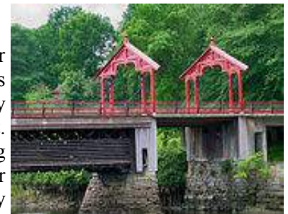
The old City Bridge over Nidelva